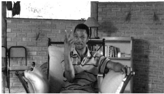
Figure 5a: The sign |xoo ('gemsbok')