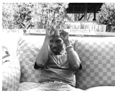
Figure 4b: The sign DU ('eland')