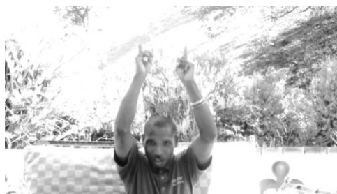
Figure 4a: The sign ||XOA ('antelope')