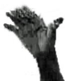
Figure 2: Unmarked 5-handshape in |'uen

Concerning the handshape inventory of |'uen, the data revealed 14 phonetic handshapes. Two of these are unmarked: 1 and 5. The 1-handshape was already shown in figure 1, the 5 handshape can be seen in figure 2 below. 2