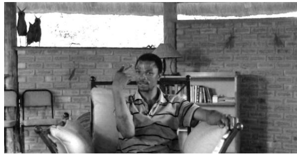
Figure 5b: The sign DUU ('eland')