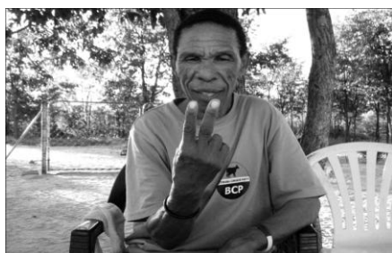
Figure 3a: The sign GAI ('steenbok')

According to the common phonological parameters in sign linguistics, hand configuration, palm orientation, location, movement and non-manuals, we tried to find minimal pairs in tshaukak'ui and |'uen. While the first three parameters were easily applicable to the signs, movement is rarely meaning distinguishing and non-manuals were not meaning-distinguishing at all. Below, examples of minimal pairs are given in Figures 3-5. 3