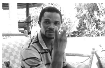
Figure 3b: The sign ||XOA ('antelope')